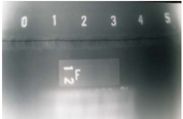
A radiograph of the defected weld with lack of root penetration confirmed by the dark circumferential line.