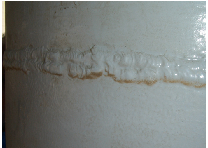
A close up view of the defected weld with lack of root penetration which is visually unobservable.