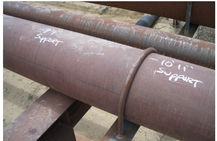
Guided wave testing can screen under sliding and clamped supports.