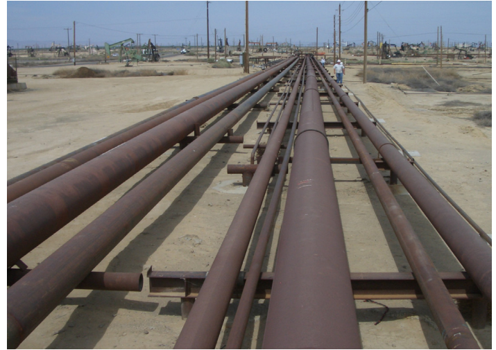
An overview of the 20" main gas gathering line.