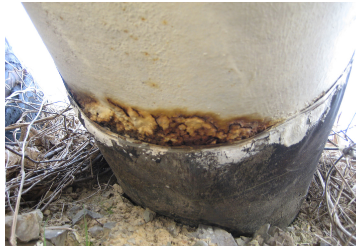
Corrosion patch detected at the entrance location.