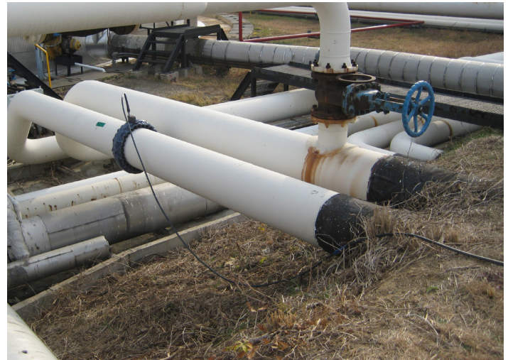
An overview of the pipe at the earth penetration