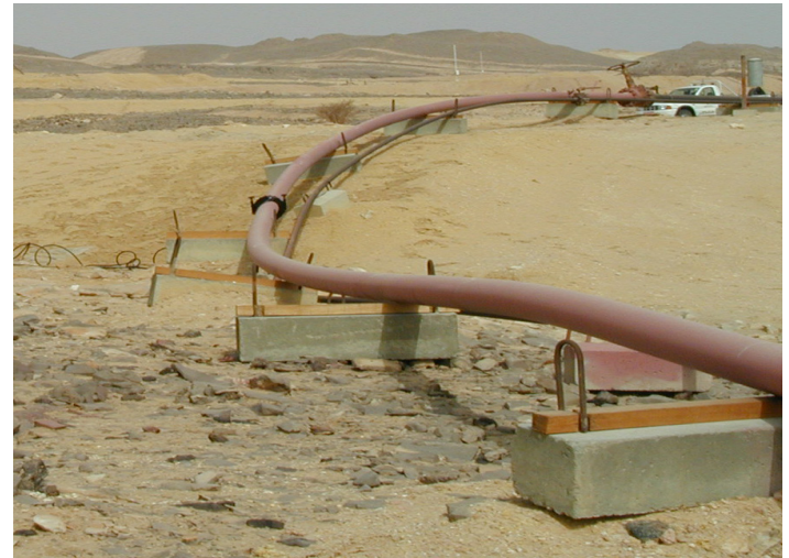
An overview of the pipeline resting on simple supports