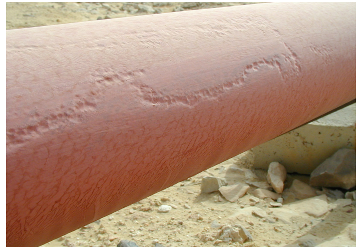
A close-up of the general corrosion on the pipeline.