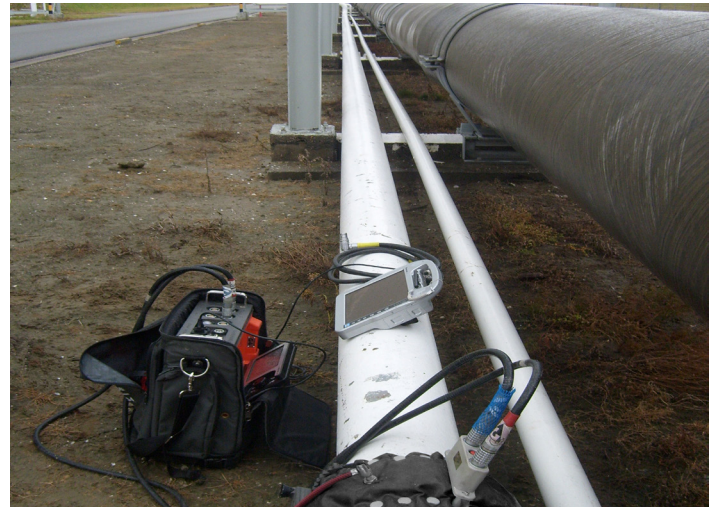
An overview of the 8" pipe under inspection.