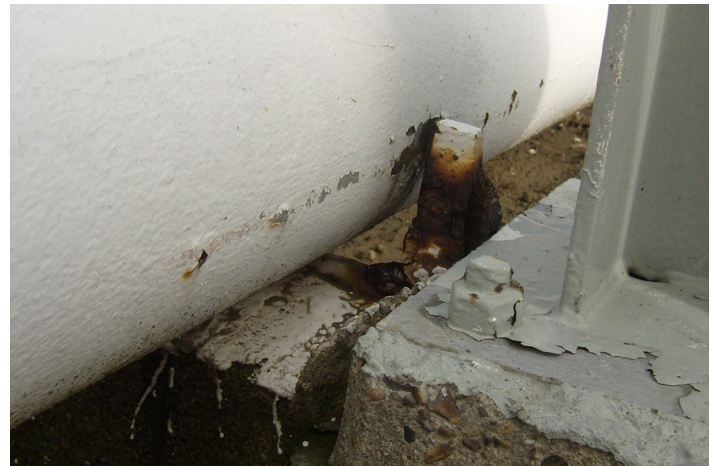
A close up view of a corrosion under a simple support located by interpreting the guided wave test results.