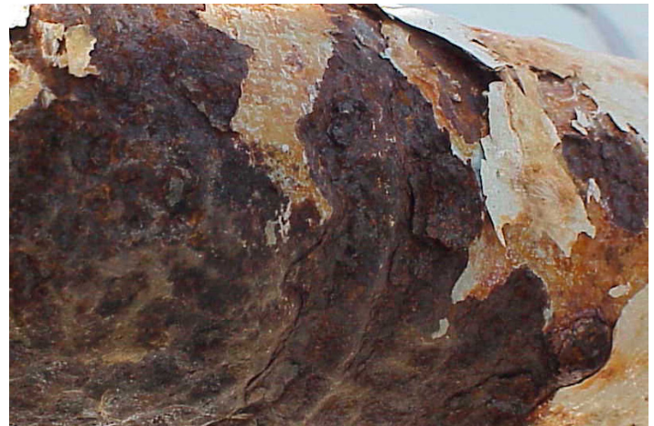
An area of severe corrosion on the 8" insulated pipe.