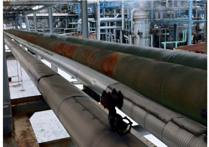
An overview of the 8" insulated pipe resting on the pipe rack.